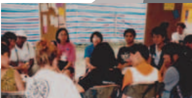
It's Her Right Asia Safe Abortion Partnership 13 minutes