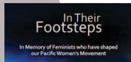
Pacific Women's Conference Tribute Video Femlink Pacific 10 minutes