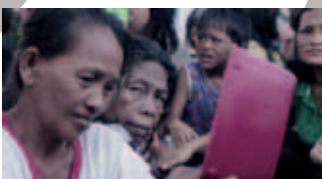
Status Update - Women, Conflict and Social Media Isis International, Jera, APWW 15 minutes