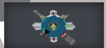
The Road to Development Justice APWLD 7 minutes