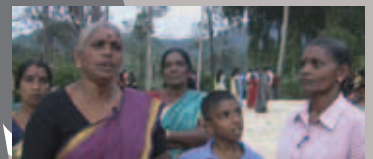
Where are Women in Local Government? Women and Media Collective 9:31 minutes