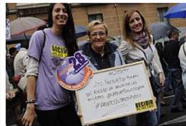
Plataforma Decidir Nos Hace Libres