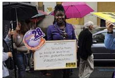
Plataforma Decidir Nos Hace Libres