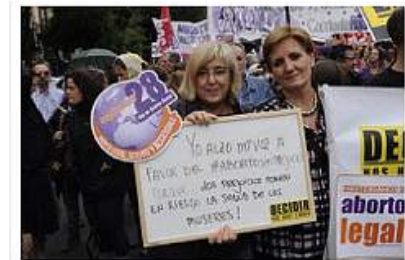
Plataforma Decidir Nos Hace Libres