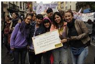
Plataforma Decidir Nos Hace Libres

Our campaign amplifies our message, not only has the number of activities in the participating countries and number of NGOs involved increased, their impact is also greater. We have seen an increased number of reports of activities in national newspaper articles and in visual media, in all of our working languages. The social media outreach resulted in millions of on-line users participating in on-line discussions with the hashtags #Sept28, #AbortionStigma and #AbortoLegal. Some of the activities on September 28th were carried out by established reproductive rights groups, while other organizations and networks addressed the issue of unsafe abortion publicly for the first time.